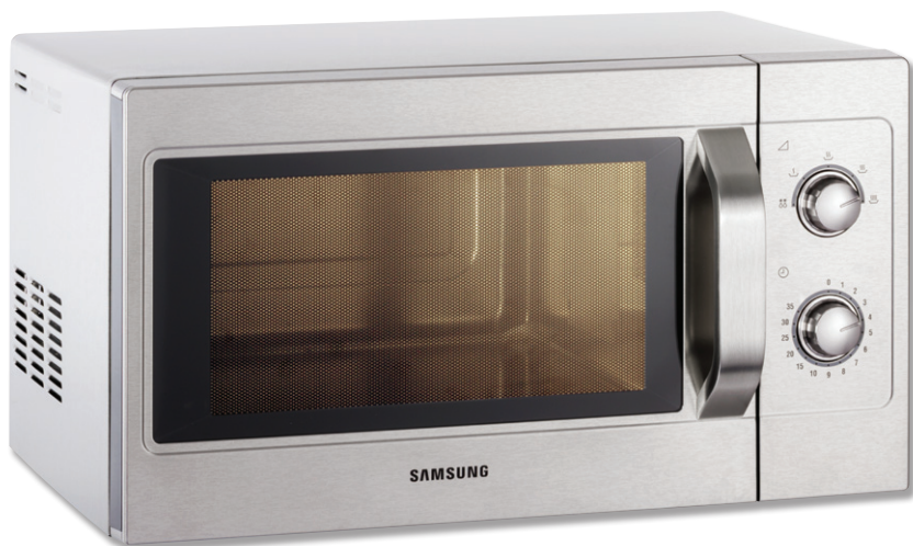
Code: CB936 Model: CM1099

Ideal for cooking or reheating in light duty locations such as small cafes and restaurants, low volume vending sites, offices and staff rooms.