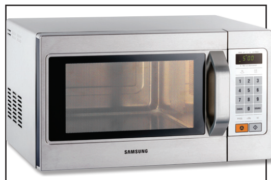
Code: CB937 Model: CM1089