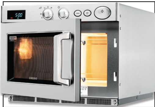
Code: C528 Model: CM1919

The Samsung heavy duty range uses 2 Magnetron + 2 wave guide for even heat distribution ensuring that food is heated evenly, and without hot and cold spots.