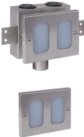
CS-TFP - Replacement Front plate available