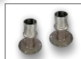
Optional S/S Feet available.