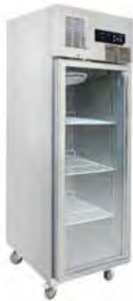
SUCG500 / SUFG500