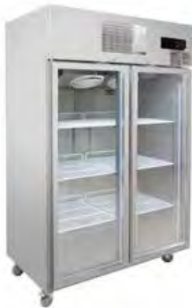
SUCG1000 / SUFG1000