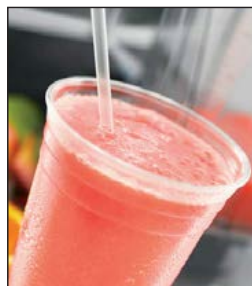
Strawberry Orange Smoothie