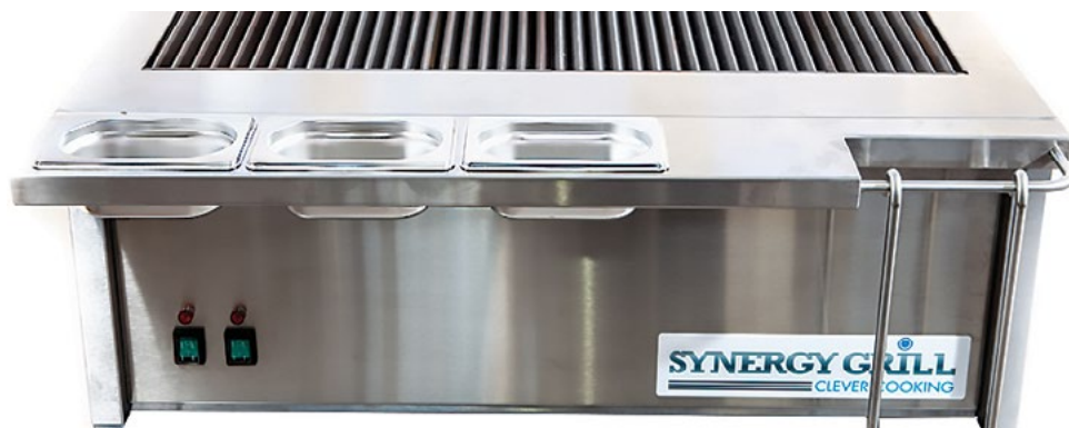
Synergy Griddle Plate