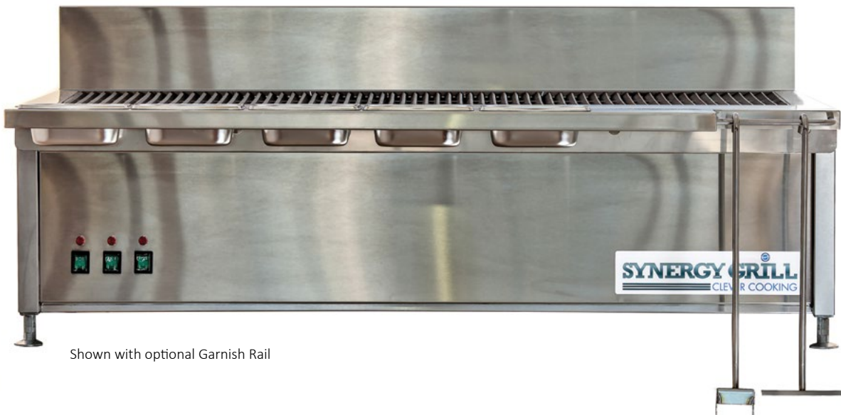
Shown with optional Garnish Rail