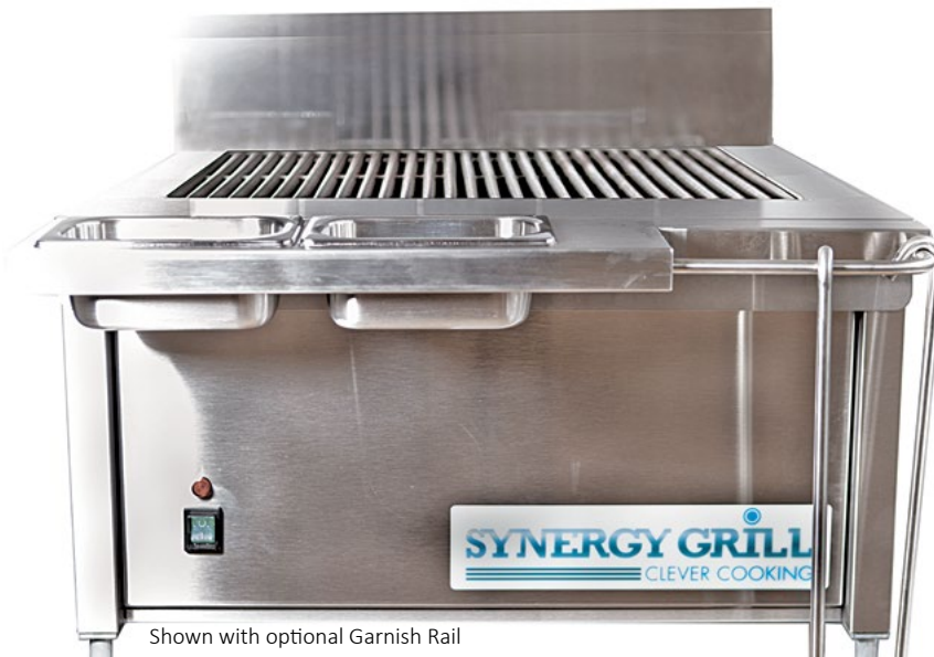
Shown with optional Garnish Rail