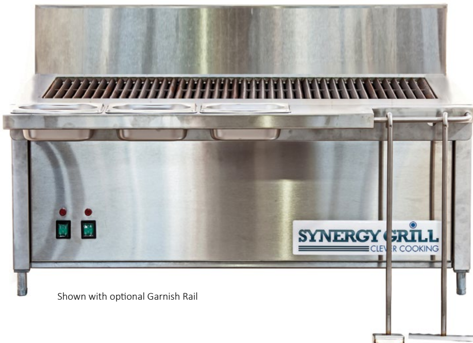
Shown with optional Garnish Rail