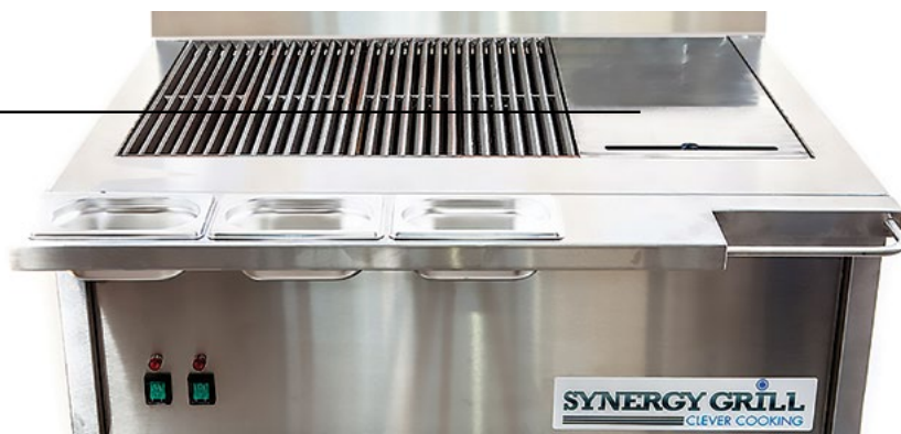
Synergy Resting Shelf