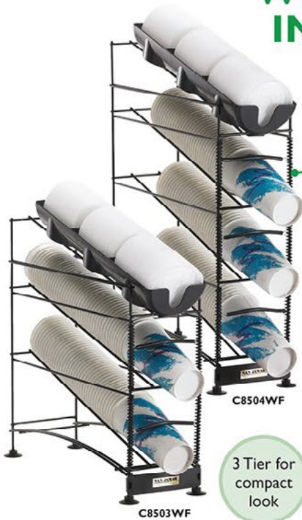
3 Tier for compact look