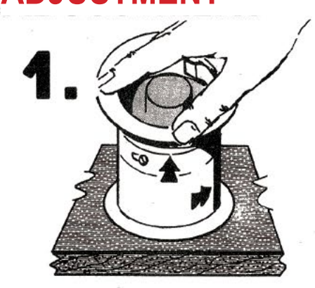
Remove dispenser from counter by rotating counterclockwise and pulling from hole.