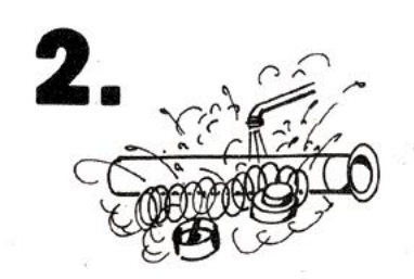
Remove spring and cup holder., Wash all parts with warm soapy water to remove dirt and wax build up. Do not bend the adjustment clips by hand.