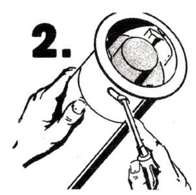
Loosen locking screw, and load cups into dispenser.