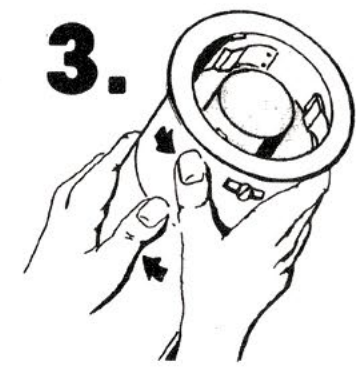
Turn collar counterclockwise until adjustment clips hold cups firmly in place. Tighten locking screw. DO NOT BEND CLIPS BY HAND!

NOTE: For proper operation, cups should dispense from middle of adjustment clips.