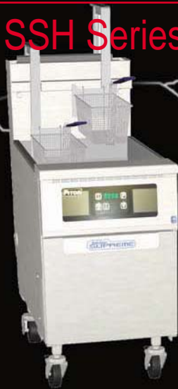
SSH75 with Optional I-12 Computer, BL, Casters