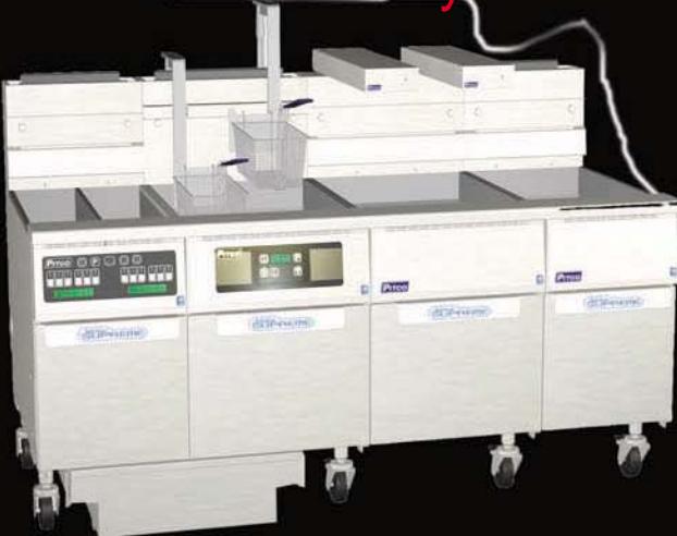
SSH55T / Filter / 75 / BNB / 55