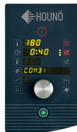
K standard model