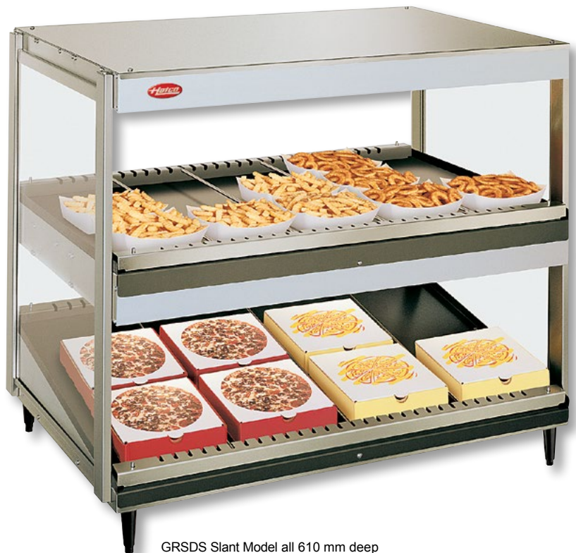
GRSDS Slant Model all 610 mm deep

FSM (FOOD SERVICE MACHINERY PTY. LTD.) HEAD OFFICE: UNIT E6, 63-85 TURNER STREET, PORT MELBOURNE, VIC. 3207 AUSTRALIA T: +61 3 8645 2555 F: +61 3 8645 2565 E: sales@fsm-pl.com.au W: www.fsm-pl.com.au