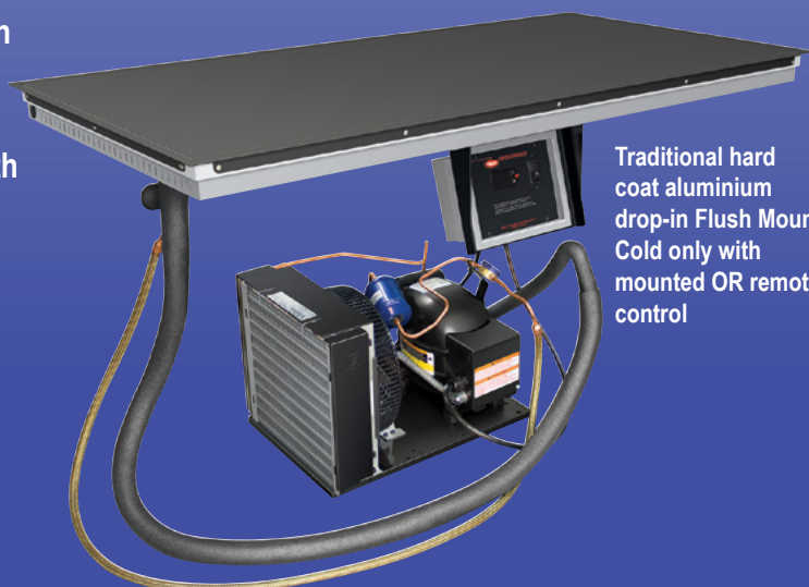
Traditional hard coat aluminium drop-in Flush Mount Cold only with mounted OR remote control