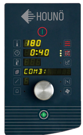
B standard model