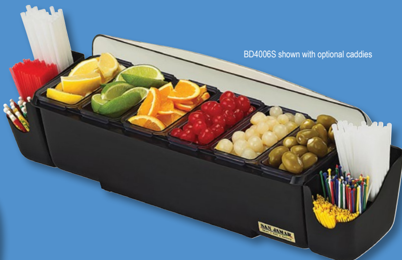
BD4006S shown with optional caddies