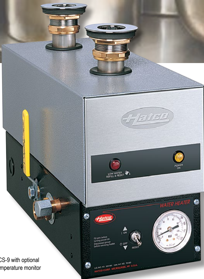
3CS-9 with optional temperature monitor

Maintaining a continuous supply of sanitizing rinse water without taking up valuable space, the 3CS makes manual warewashing faster and more convenient.