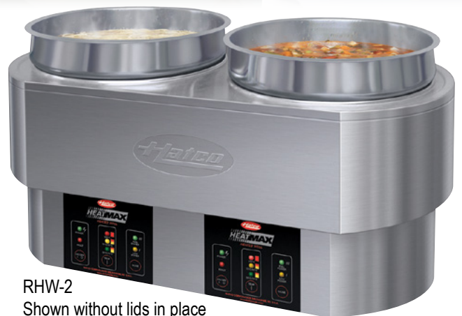
RHW-2 Shown without lids in place