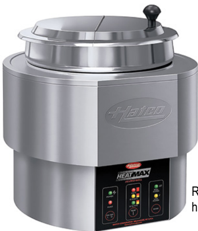
RHW-1 Shown with hinged lid in place