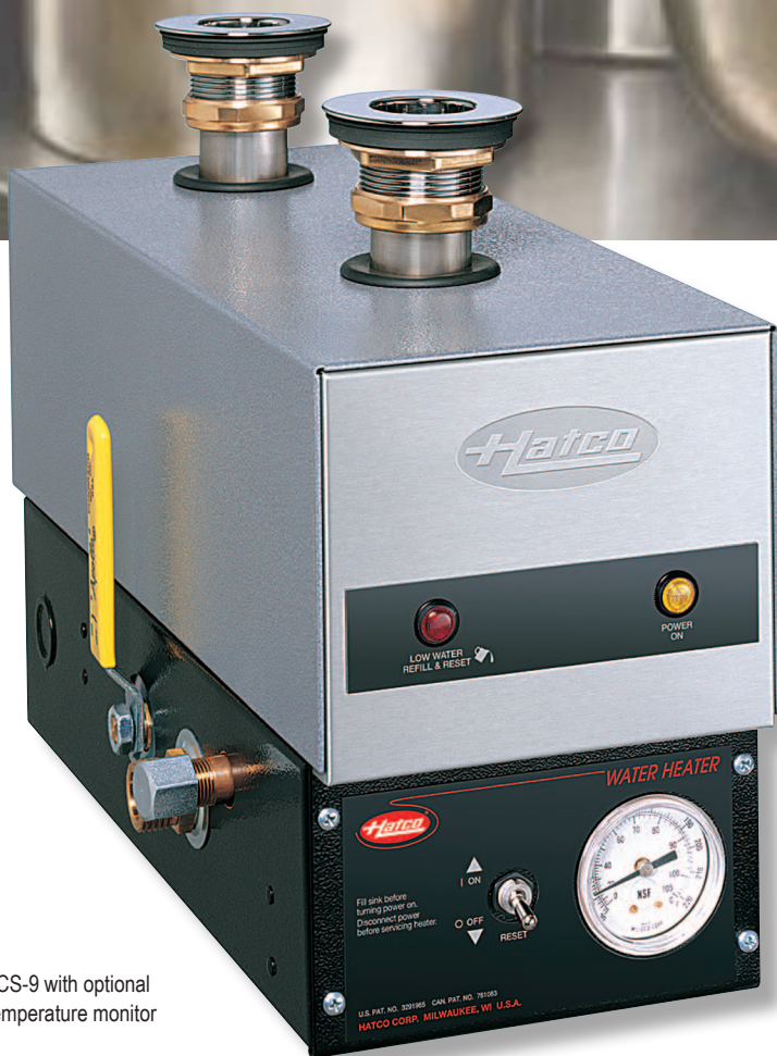
3CS-9 with optional temperature monitor

Maintaining a continuous supply of sanitizing rinse water without taking up valuable space, the 3CS makes manual warewashing faster and more convenient.