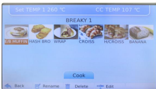
Fully programmable touchscreen controls